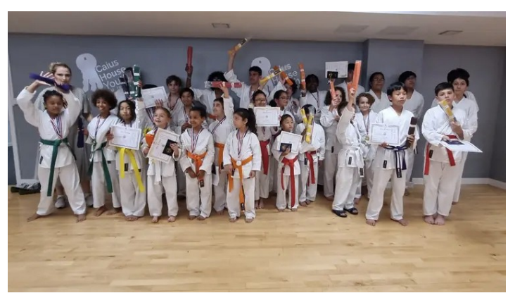
WoW Karate Kids at the last term