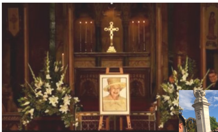
Photo: At the St. Mary Magdalene Church and bellow at the Buckingham Palace lawn

Women of Wandsworth attended the Civic Service of Remembrance and Thanksgiving for Queen Elizabeth II at the St. Mary Magdalene Church on Wandsworth Common with the Worshipful