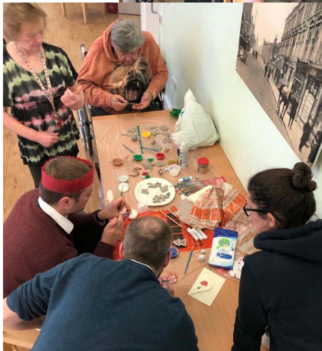
Residents making clay ornaments in Haven Lodge