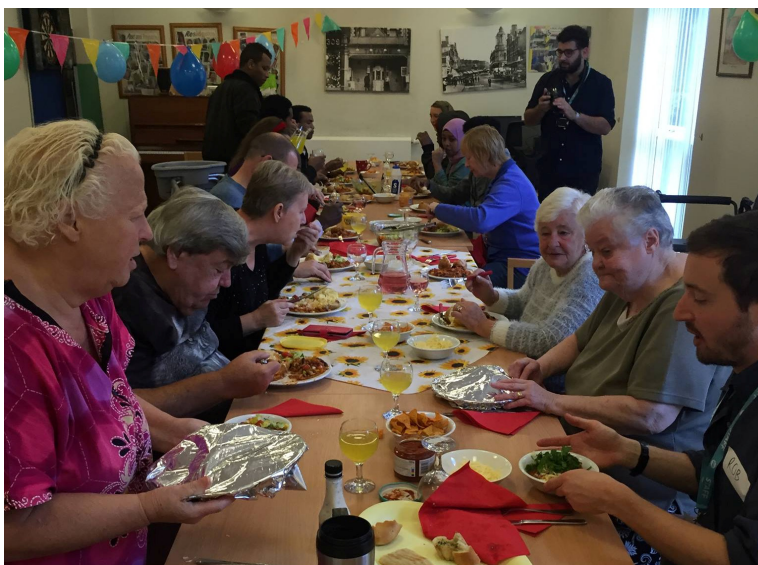
Headstart youth, WoW Mums and elderly residents in Haven Lodge

As part of Homestart, WoW Mums are mentoring young refugees, who are legally in UK, to deliver a social action project, that will allow them the chance to