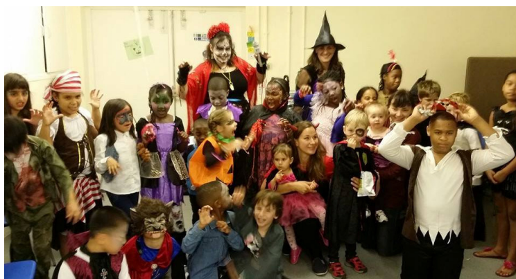
WoW Halloween party in Kambala Club Room

Due to the popularity of WoW Mums' fun Halloween Parties, we have been asked to organise and delivered a local community party in Kambala Club Room for all the residents of Kambala Estate, Falcon Estate and Battersea High Street R.A. This party not only made a safe place for all the children to be entertained at, but it also provided a place to make new friends from the neighboring estates.