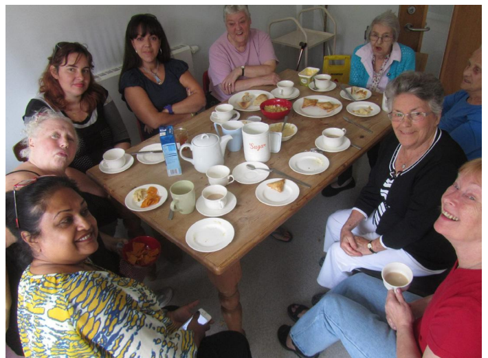
WoW Mums coffee Morning in Haven Lodge this month

Please join us on 8th October in Haven Lodge at 11am to try your talent.