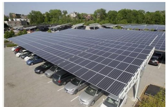
Right: Solar Car Park

It is very encouraging that the residents are very interested and supportive of this initiative. Residents in Brixton have already put solar panels on their blocks as you can see in this video: www.brixtonenergy.co.uk . Wandsworth Council officials think that this could be a good solution for the problem of charging the mobility scooters for the elderly and for the electric cars. The charging points could be powered by solar energy in solar car parks.